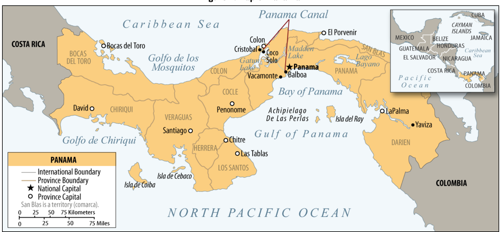
Figure 1. Map of Panama