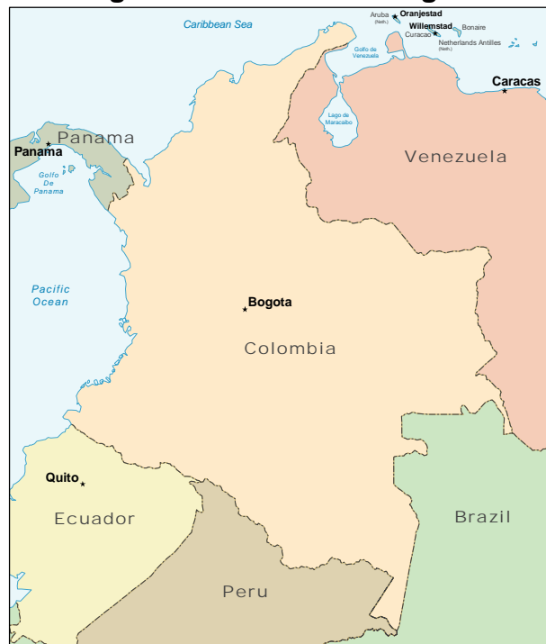
Figure 3. The Andean Region

Funding for the Andean Counterdrug Initiative (ACI) amounted to $725 million in FY2005. The region also receives economic assistance funds. Bolivia and Peru are major recipients of Development Assistance, Child Survival and Health Funds, and food aid. Ecuador and Peru receive sizeable amounts of Economic Support Funds. The Peace Corps maintains programs in Bolivia, Ecuador, Panama, and Peru. While Colombia is a major recipient of ACI funds, it does not receive any economic