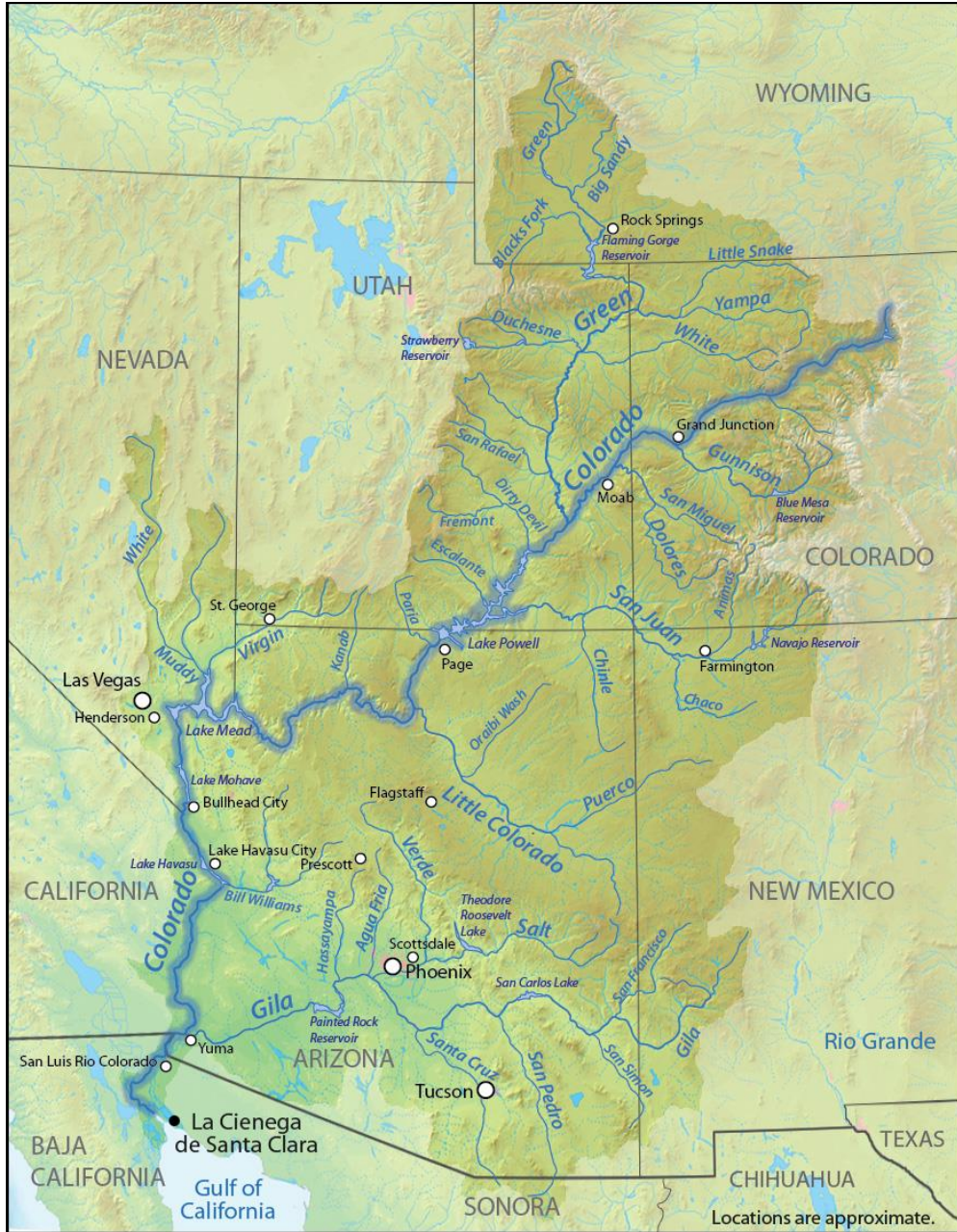
Figure I. Colorado River Basin