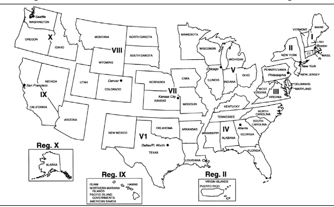
Figure 2. Standard State and Territorial Boundaries for Federal Regions

Enacted in 1986, the Emergency Planning and Community Right-to-Know Act (EPCRA)<sup>40</sup> required each state to create a State Emergency Response Commission (SERC), designate emergency planning districts, and establish Local Emergency Planning Committees (LEPCs) for each district. Each LEPC must prepare a local emergency response plan for the emergency planning district. These local emergency plans are integrated into the appropriate geographic-specific area response plan that may cover several local planning districts, <sup>41</sup> discussed in the "Area Committees" section of this report below.