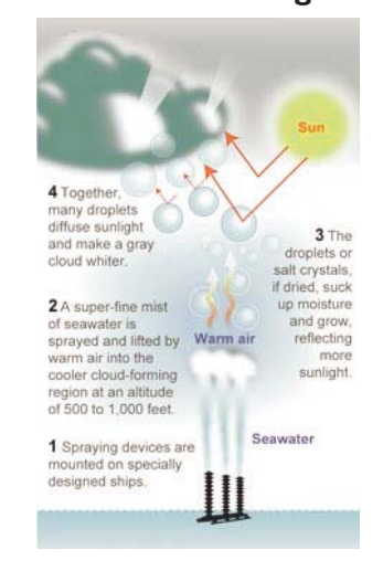
Figure 2. Cloud Whitening Schematic

The long-term implications of deploying cloud whitening are not yet fully understood. Depending on the scale of the project, marine ecosystems could be disturbed. Further research is needed for spray generator development, and to assess potential impacts on ocean currents and precipitation patterns. Moreover, the amount of cooling that could take place and at which locations requires greater study. One study identified the west coast of North America, among other locations, as an area where cloud albedo might be effectively enhanced.<sup>61</sup>