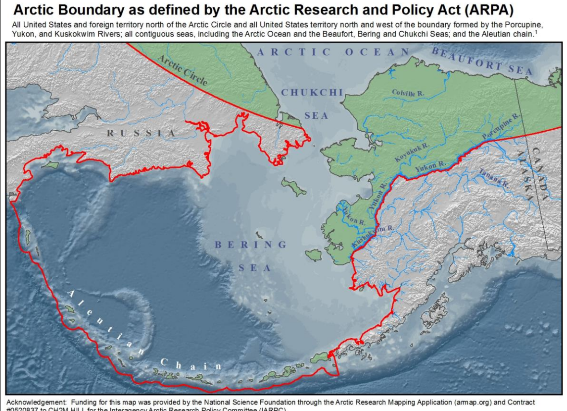
Figure 1. Arctic Area of Alaska as Defined by ARPA

Acknowledgement: Funding for this map was provided by the National Science Foundation through the Arctic Research Mapping Application (armap.org) and Contract #0520837 to CH2M HILL for the Interagency Arctic Research Policy Committee (IARPC). p author: Allison Gaylord, Nuna Technologies. May 27, 2009.