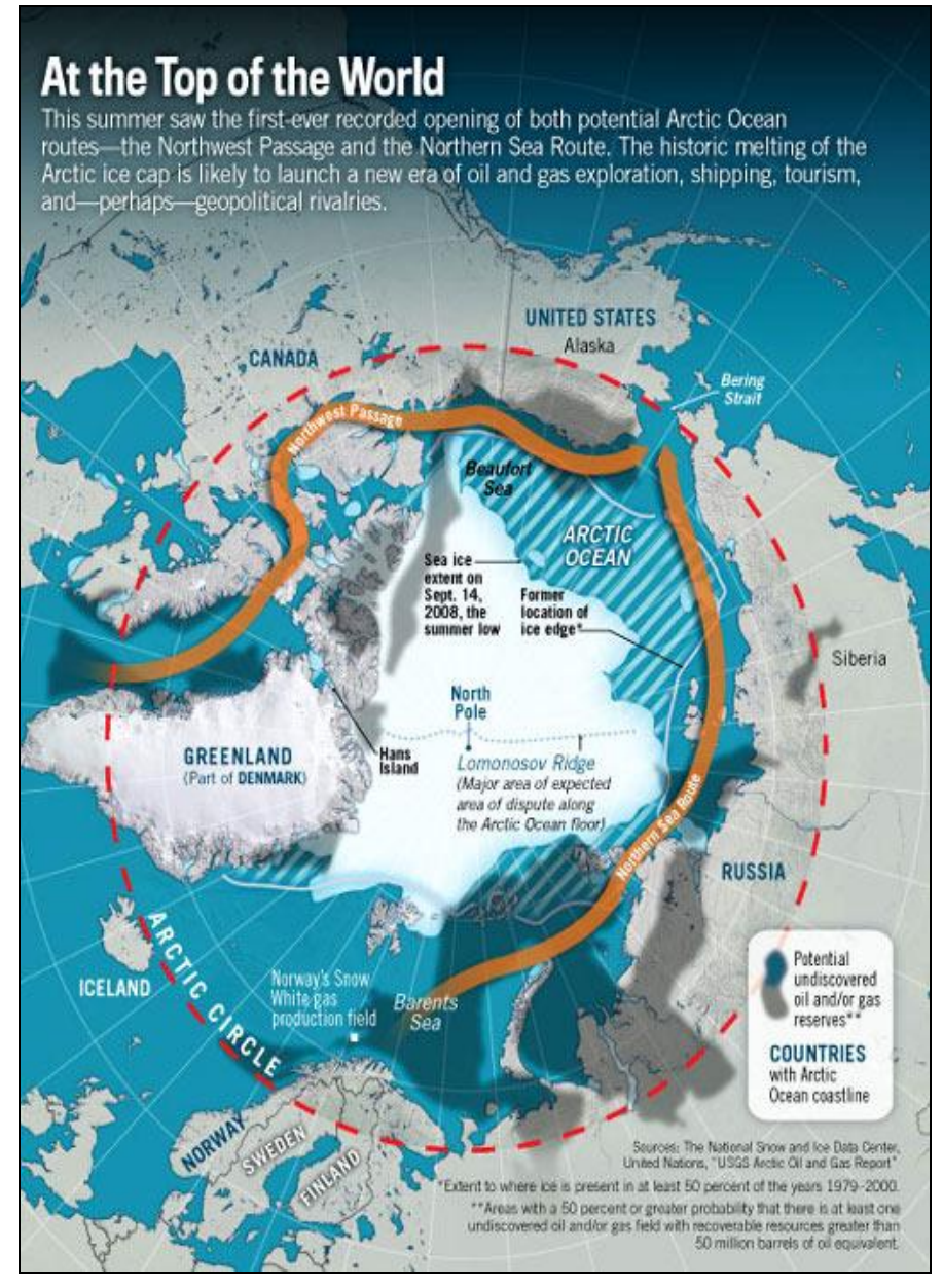
Source: Graphic by Stephen Rountree at U.S. News and World Report, http://www.usnews.com/articles/news/ world/2008/10/09/global-warming-triggers-an-international-race-for-the-artic/photos/#1.