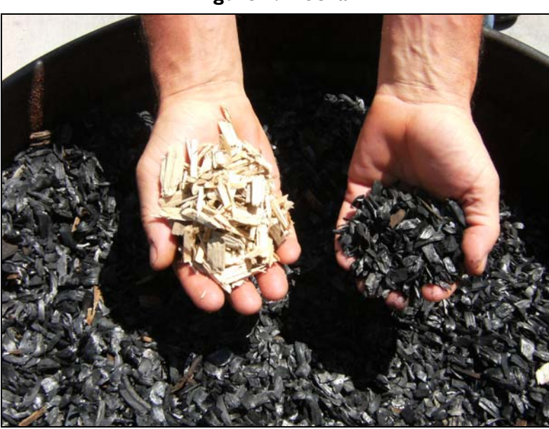
Figure I. Biochar