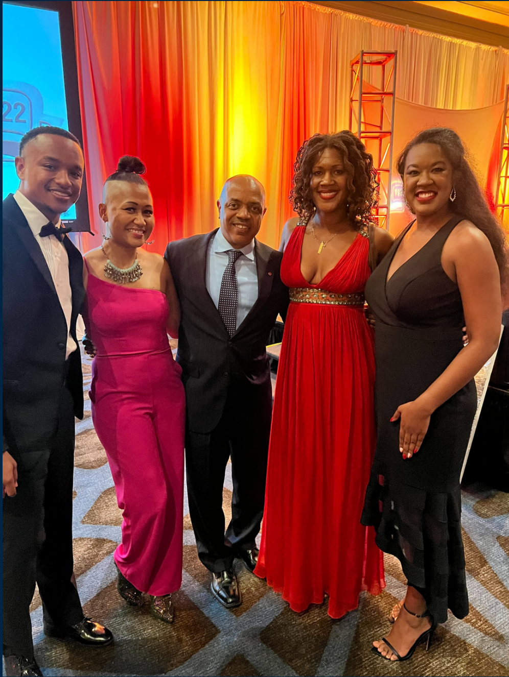
Federation's Annual Meeting Gala