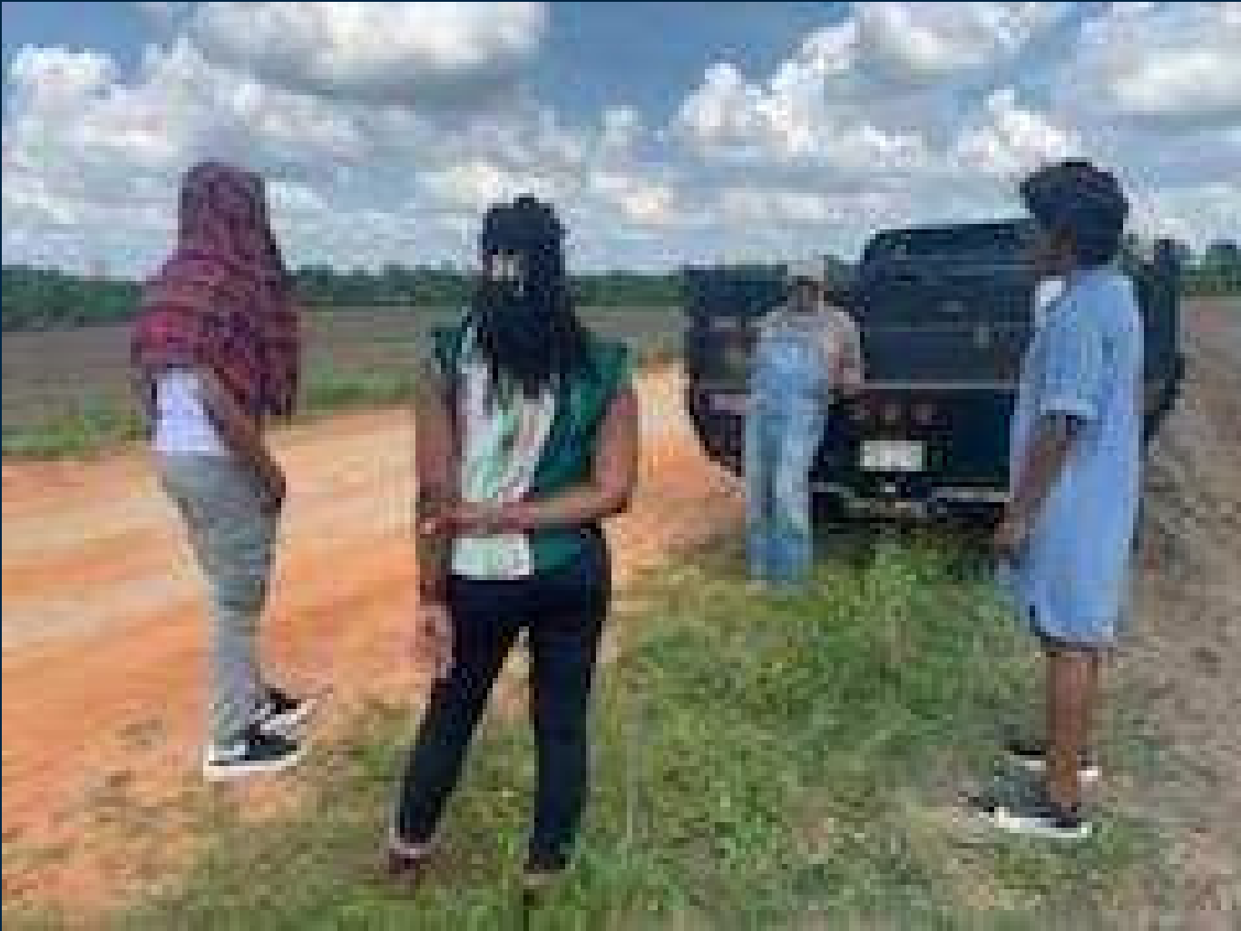
Planting watermelons with the Indian Springs Cooperative Farmers