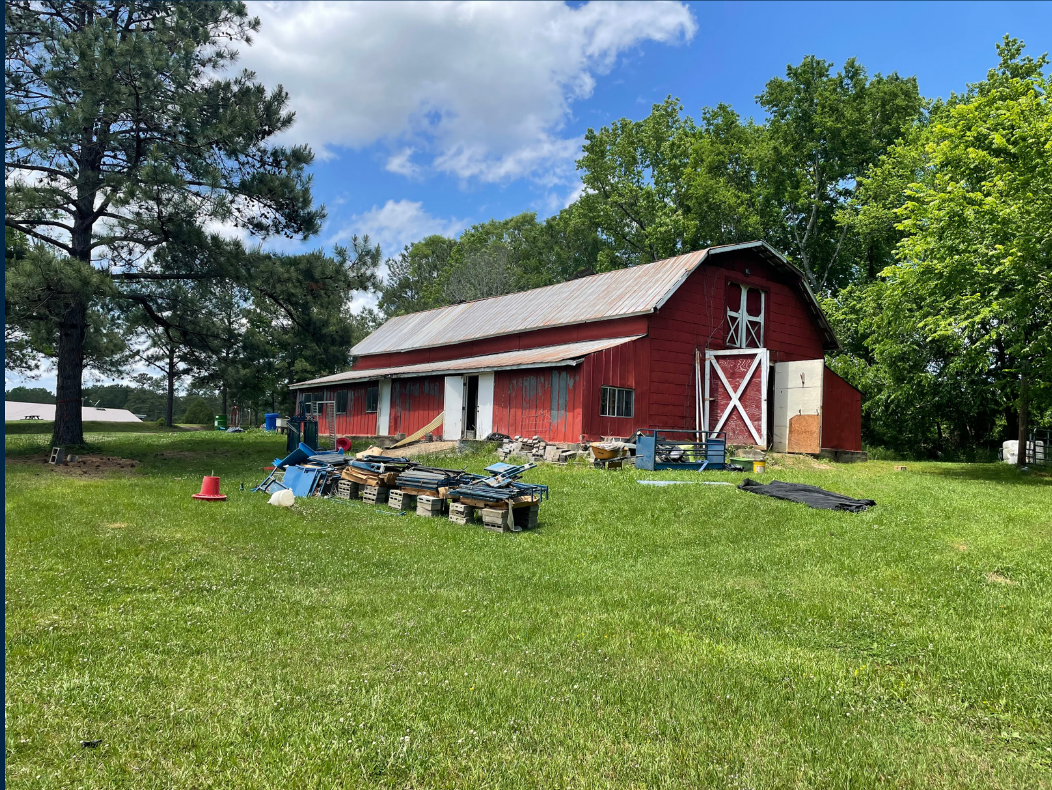
One of the best parts of my job is connecting with farmers on the land.