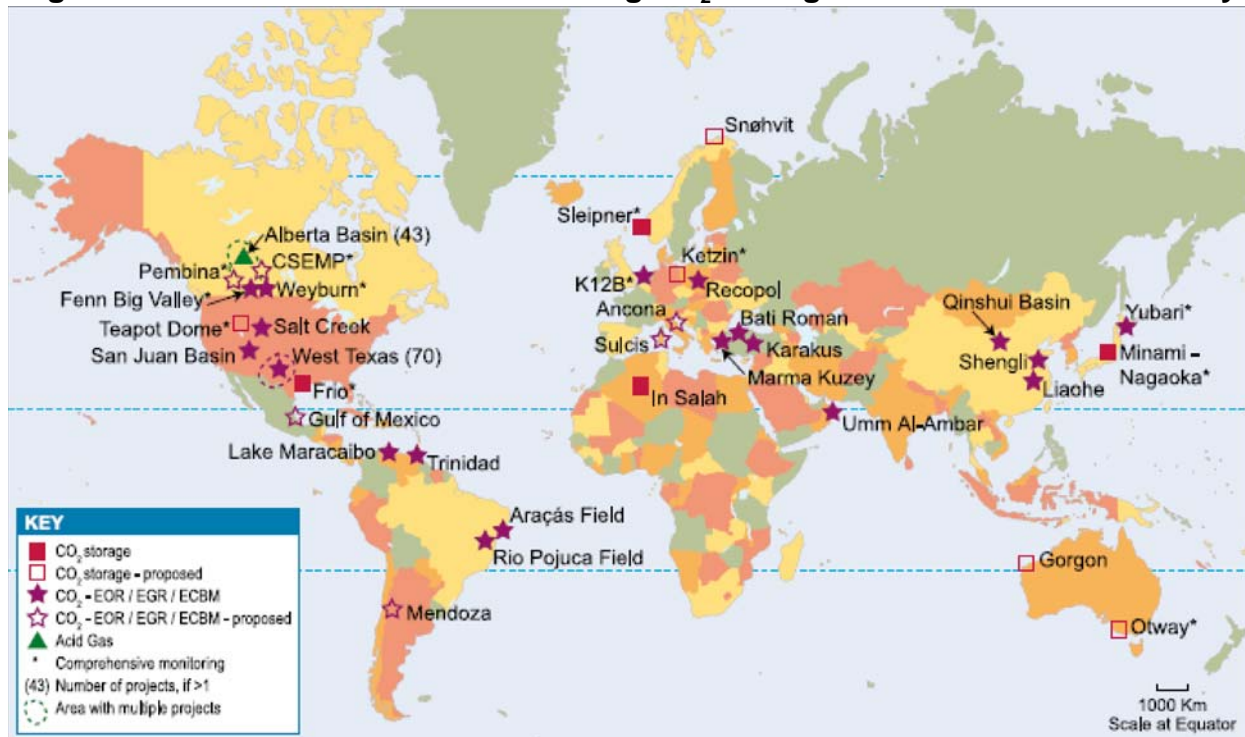
Figure 1. Sites Where Activities Involving CO 2 Storage Are Planned or Underway