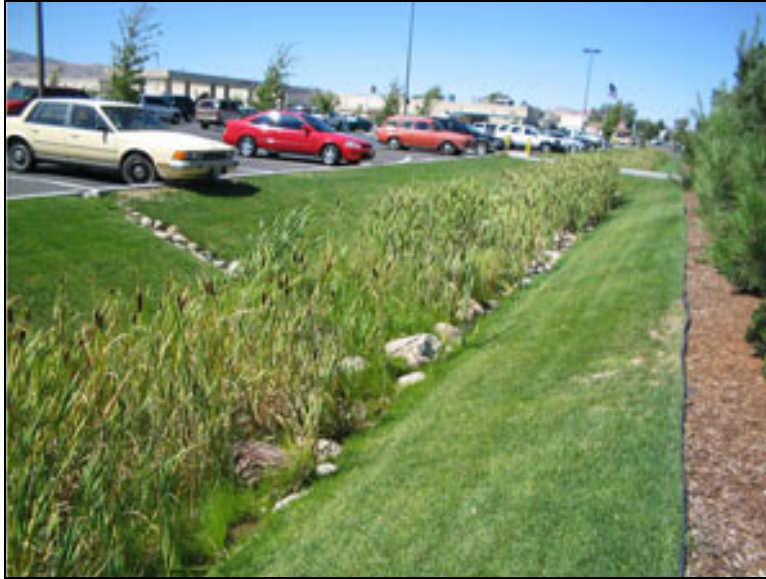
Figure A-3. Vegetated Swale