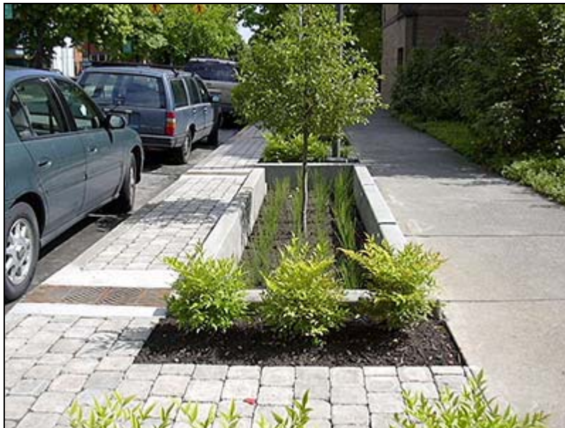
Figure A-4. Infiltration Planter