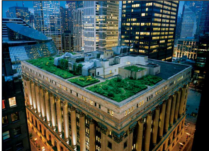
Figure A-1. Green Roof in Chicago