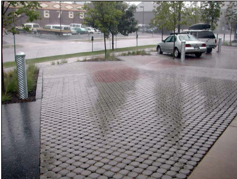
Figure A-5. Permeable Pavement