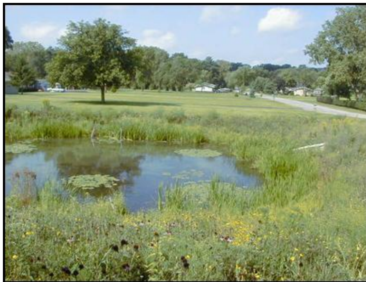
Figure A-6. Constructed Wetland for Stormwater Management