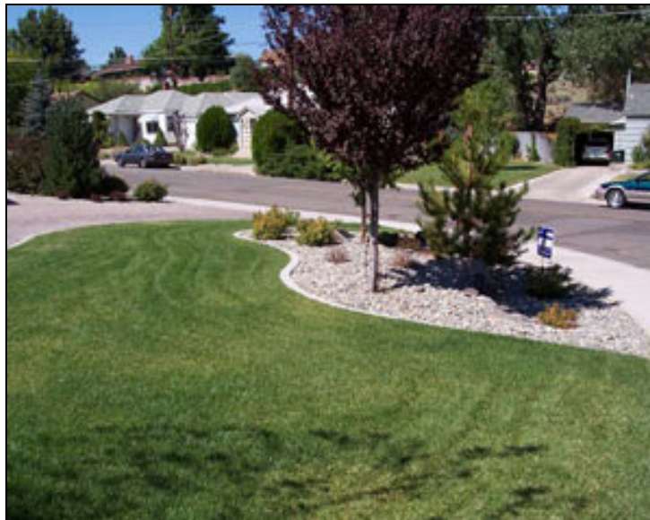
Figure A-2. Rain Garden