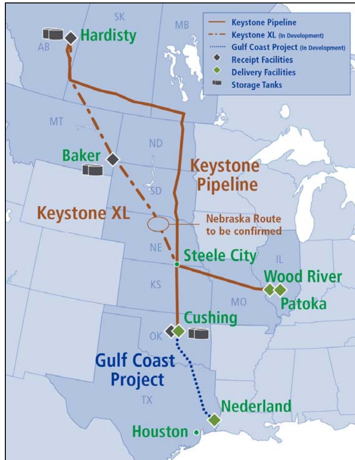
Figure 1. The TransCanada Keystone Pipeline System: Keystone and Keystone XL