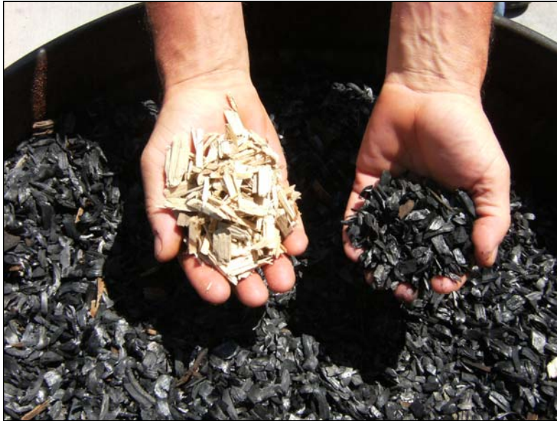
Figure 1. Biochar