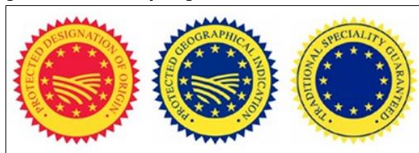
Figure 1. EU Quality Registration Markers

More than 4,560 product names are registered and protected in the EU for foods, wine, and spirits originating in EU member states (about 3,400 registrations) and also in other countries (another 1,160 registrations). See Table 1 . Most product registrations under the EU’s system originate in the EU—mostly Italy, France, and Spain—however, countries outside the EU have also registered product names under the EU’s quality scheme, including products from Eastern Europe, Asia, and Latin America. The United States holds nearly 700 “Names of Origin” registrations for wine.