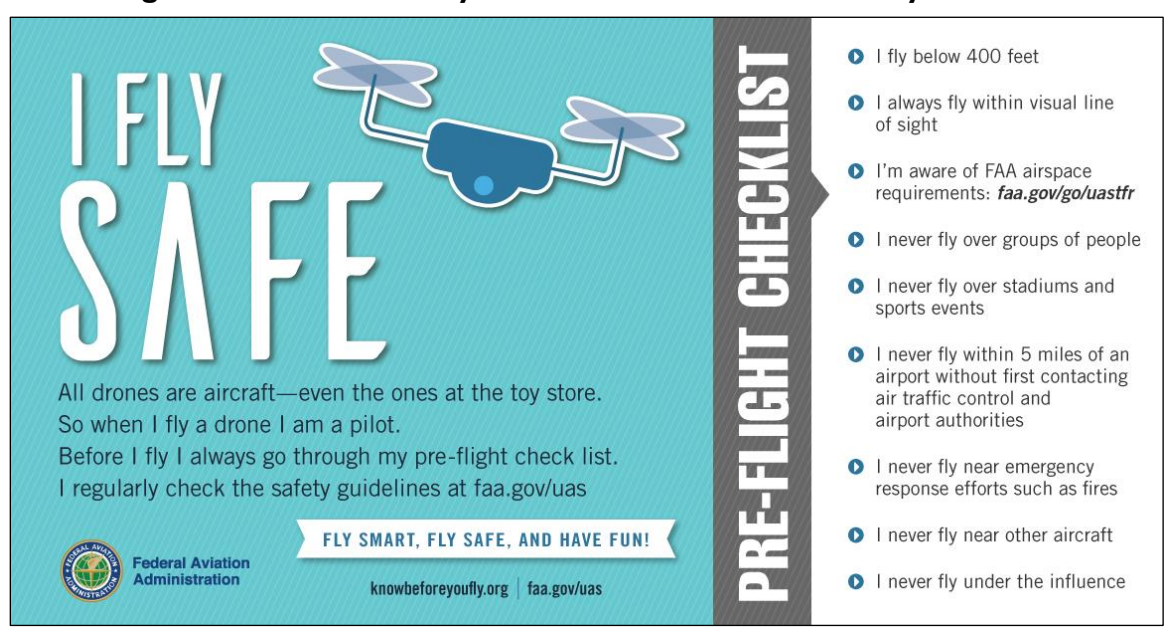
Figure 3. FAA's 2015 "I Fly Safe" Unmanned Aircraft Safety Checklist