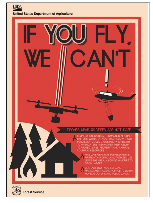
Figure 4. U.S. Forest Service Educational Poster

In addition to concerns about flights in the vicinity of wildfires, UAS activity over sporting events and other outdoor gatherings has been a particular problem. Despite existing security restrictions prohibiting flights over professional sporting events, including professional and college football games, over certain outdoor venues such as Disney theme parks, and over national securitysensitive sites, like the White House, UAS, mostly hobby drones, have been spotted in all of these areas. In response, FAA has released public safety materials to convey that temporary flight restrictions (TFRs) also apply to UAS, and TFR areas are "No Drone Zones."33 FAA has also launched a public education campaign with the assistance of National